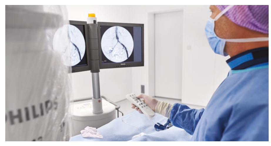
Conveniently compare MRA, CTA and other images with the live fluoroscopy image through the full-screen image viewer to save time

As surgical workloads and paperwork increase and medical staff become more scarce, your mobile imaging systems simply have to go the extra mile. The Image Guided Therapy Mobile C-arm System 5000 – Zenition 50 offers a step-up in ease of use and efficiency that helps busy imaging departments increase OR performance across the healthcare facility.