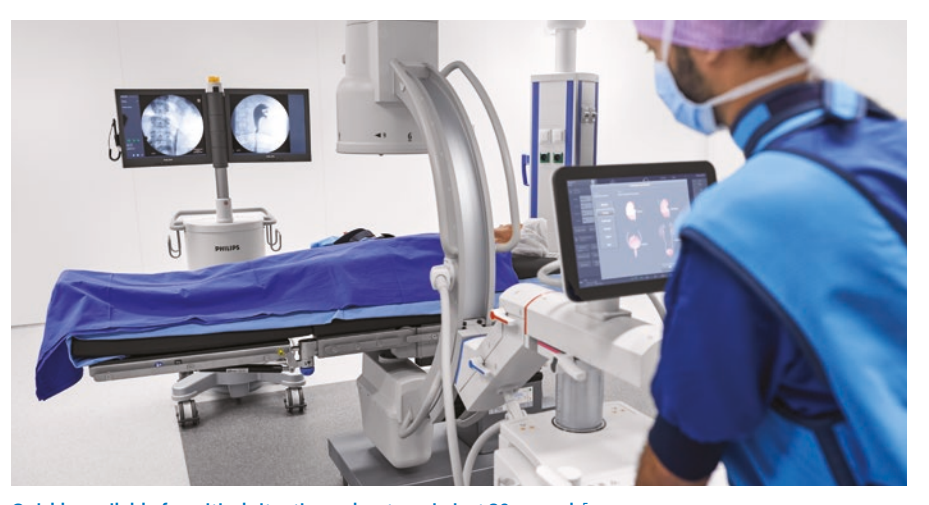
Quickly available for critical situations - boots up in just 80 seconds<sup>5</sup>

The intuitive point and shoot design of the Zenition 50 Series helps you train users faster. Customizing and exporting system settings to other Zenition 50 systems is simple with the embedded Philips Support Connect tool.